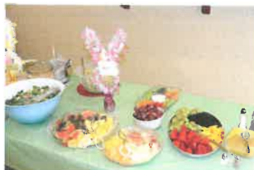
Delicious food from residents