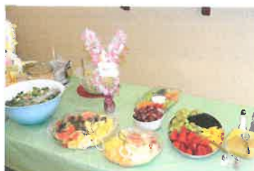
Delicious food from residents