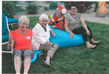
Girls just want to have fun