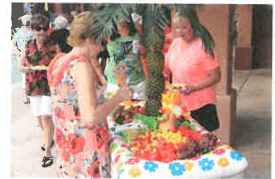
Under the pineapple palm